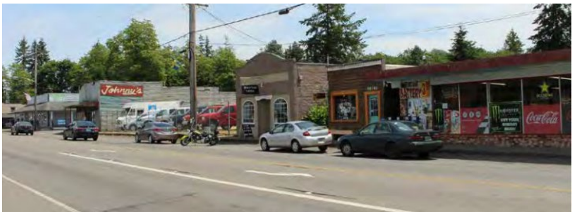
Figure 5. Businesses located along US 12 in downtown Rochester.

The community identified, during the Main Street Rochester project, that this area has the highest potential for economic development and business development. There is a vested interest in expanding and diversifying the local businesses to promote economic health and resilience. Rochester serves as major thoroughfare that could serve as a destination for travelers. The Rochester Chamber of Commerce and local businesses are active participants in the South Thurston Economic Development Initiative (STEDI) that serves to help expand economic development efforts in their community.