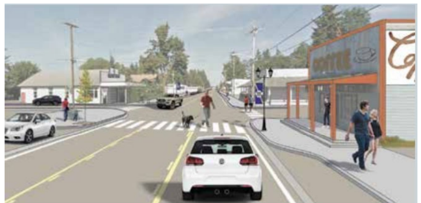
Figure 3. Conceptual design of US 12 at Bend Street Perspective

A complete list of the reports and data for this project can be found in the References and on the Thurston Regional Planning Council project website.