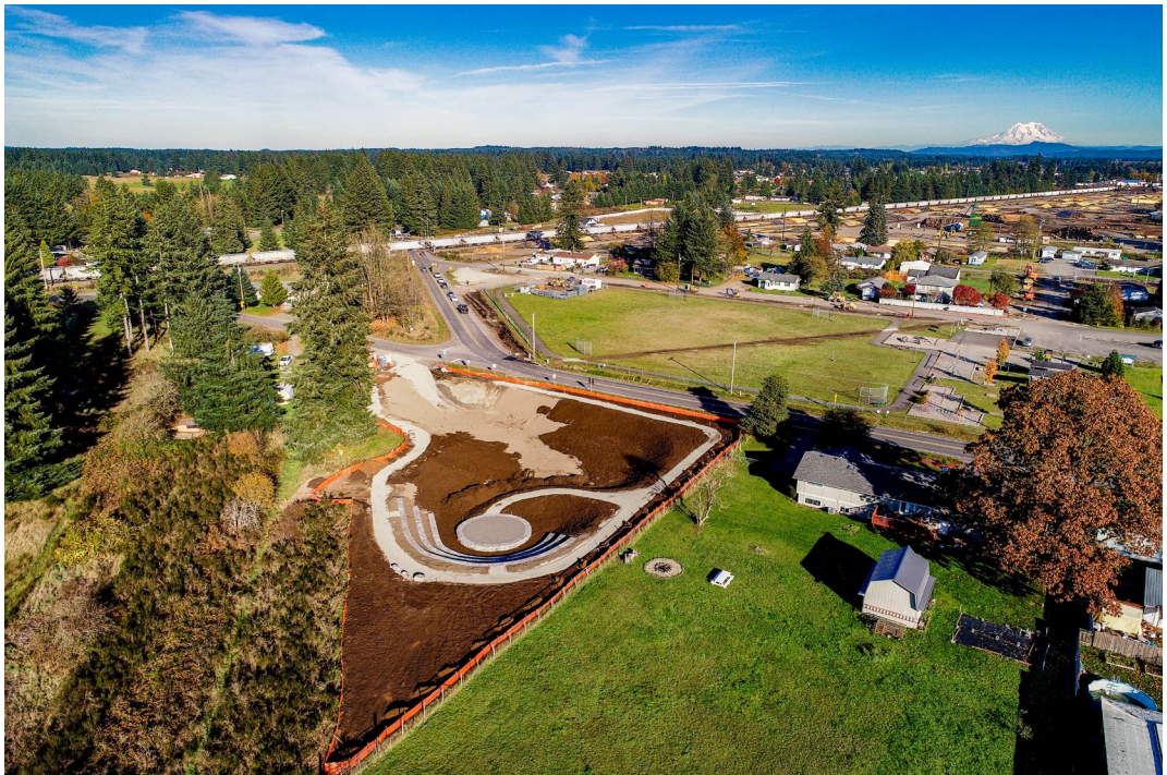
Figure 4. Albany Street Pond under construction, 2019.

Refer to Thurston County Public Works Stormwater Utility about additional regional project and the Stormwater Management Program Plan (2019) for more information.