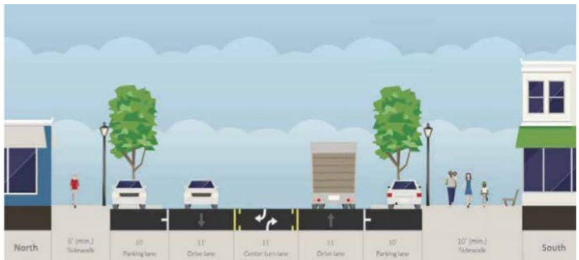
Figure 2. Conceptual design of Phase 1 – US 12 Cross-section

In addition, the project team partnered with SCJ Alliance to develop conceptual layout plans for the various phases. These renderings provide context and examples of what the community envisions for the future of downtown Rochester.