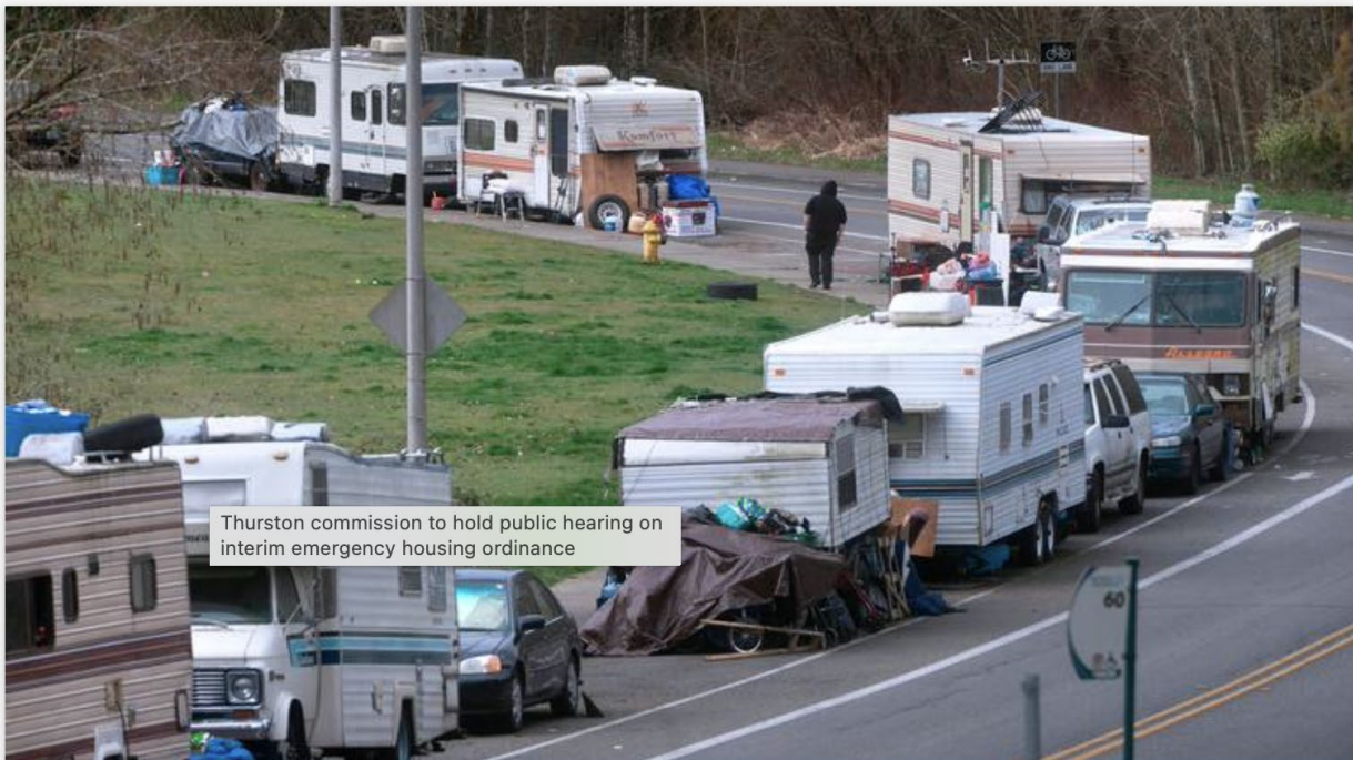
Thurston commission to hold public hearing on interim emergency housing ordinance