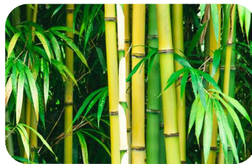
Bamboo and Roots

These problem plants will be charged as regular garbage.