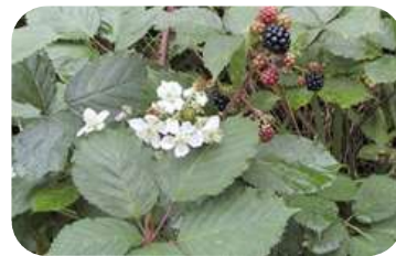
Blackberry (all kinds)