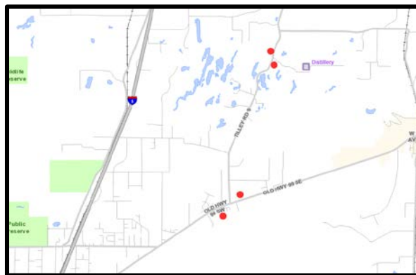
Motorist Information Sign Map