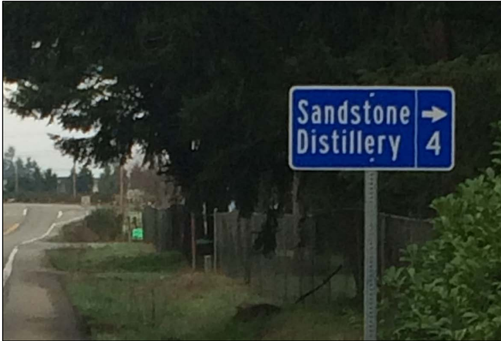
Example Sign Installation