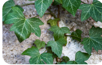
Ivy (all kinds)