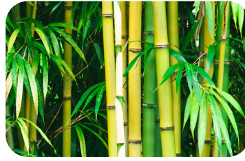
Bamboo and Roots

These problem plants will be charged as regular garbage.