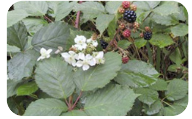
Blackberry (all kinds)