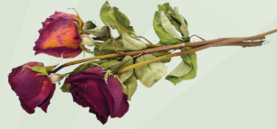
plants and flowers