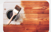
treated, stained, or painted wood