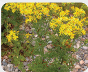
noxious weeds (for a full list visit www.thurstoncountywa.gov/pw/nw )

Missed pickup? Call your waste hauler. Thurston County does not haul garbage or recycling.