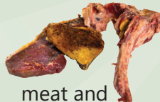
meat and bones