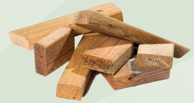
lumber scraps (untreated, unpainted, unstained - nails ok)