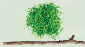
grass and branches