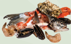
seafood and shells