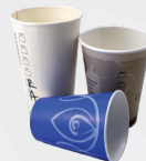
all cups, including "compostable"