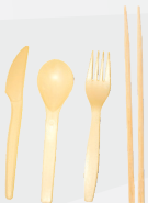
all utensils, including "compostable"