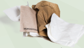
paper towels and napkins (no bathroom waste)