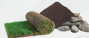
dirt, rocks, and sod