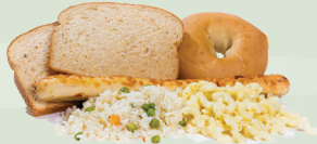
bread, pasta, and rice