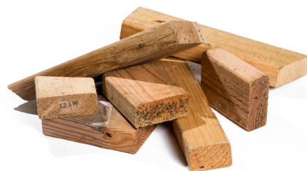
Lumber Scraps (untreated, unpainted, unstained - Nails Okay)