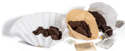
Coffee Grounds, Filters & Tea Bags