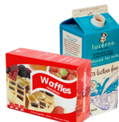
Cartons & Frozen Food Boxes