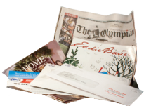
Newspaper & Mail