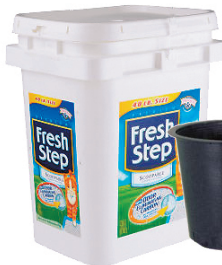
Buckets & Ridged Flower Pots (no lids, no handles)