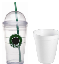
Cups - Any Kind