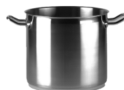
Metal Pots & Pans