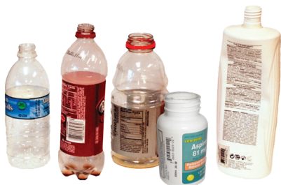
Bottles - 8oz & Larger