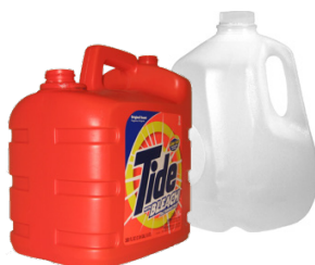
Jugs (Milk, Laundry, etc.)