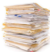
Office Paper (not shredded)