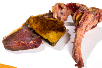
Meat & Bones