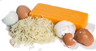
Dairy & Eggs