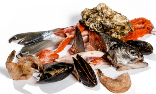
Seafood & Shells