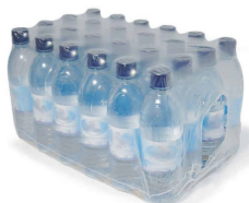
Plastic Wrap - garbage Plastic Bottles - recycle