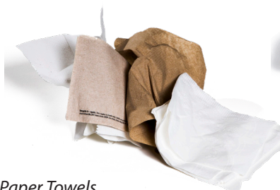
Paper Towels & Napkins