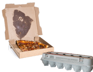
Pizza Boxes & Egg Cartons