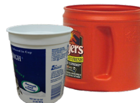
Tubs (Dairy/Coffee - no clear tubs)