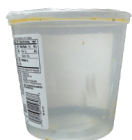
Clear Plastic Food Containers