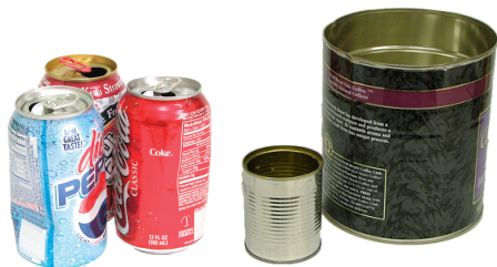
Large Cans (peaches, coffee, etc.) Aluminum Cans Tin Soup Cans