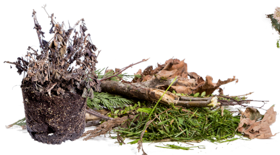
Grass, Branches & Leaves