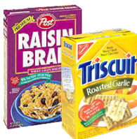
Cardboard Boxes (cereal, soda, shoe)