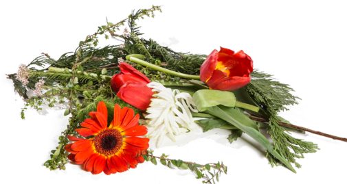
Plants & Flowers