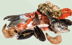
seafood and shells