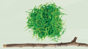
grass and branches