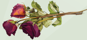
plants and flowers