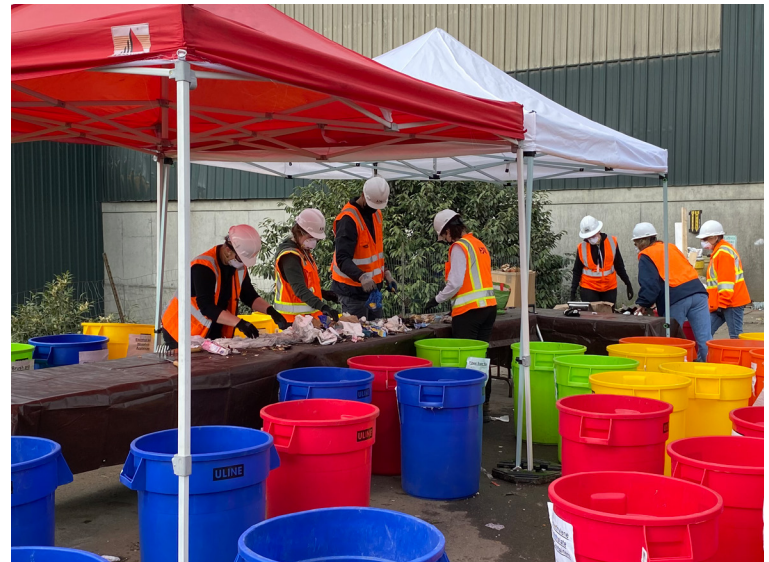
Workers sort garbage into more than 40 categories at the Waste and Recovery Center in Lacey.

By sorting samples into 42 categories, we learned organics (food and yard waste) make up 23 percent of residential curbside garbage. That equals roughly 104 million pounds per year! Food waste alone was 15.6 percent of our household garbage, or 70.2 million pounds per year.