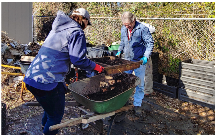
MRC volunteers sift compost at a demonstration site.