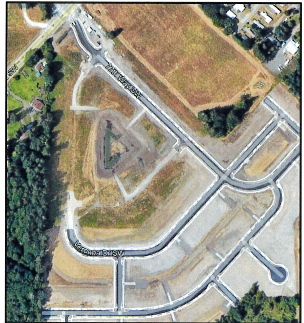
Figure 4. Sienna Site 2022