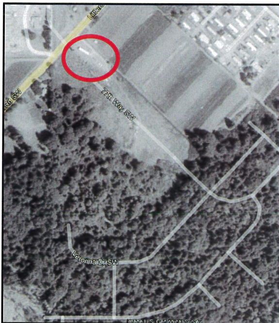
Figure 1. Sienna Site 1991