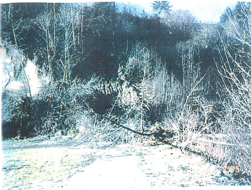
Chilinski: This house is located partway up Nisqually Bluff. The landslide began partway up the slope, and came down into the driveway, coming within a foot of the bedroom.