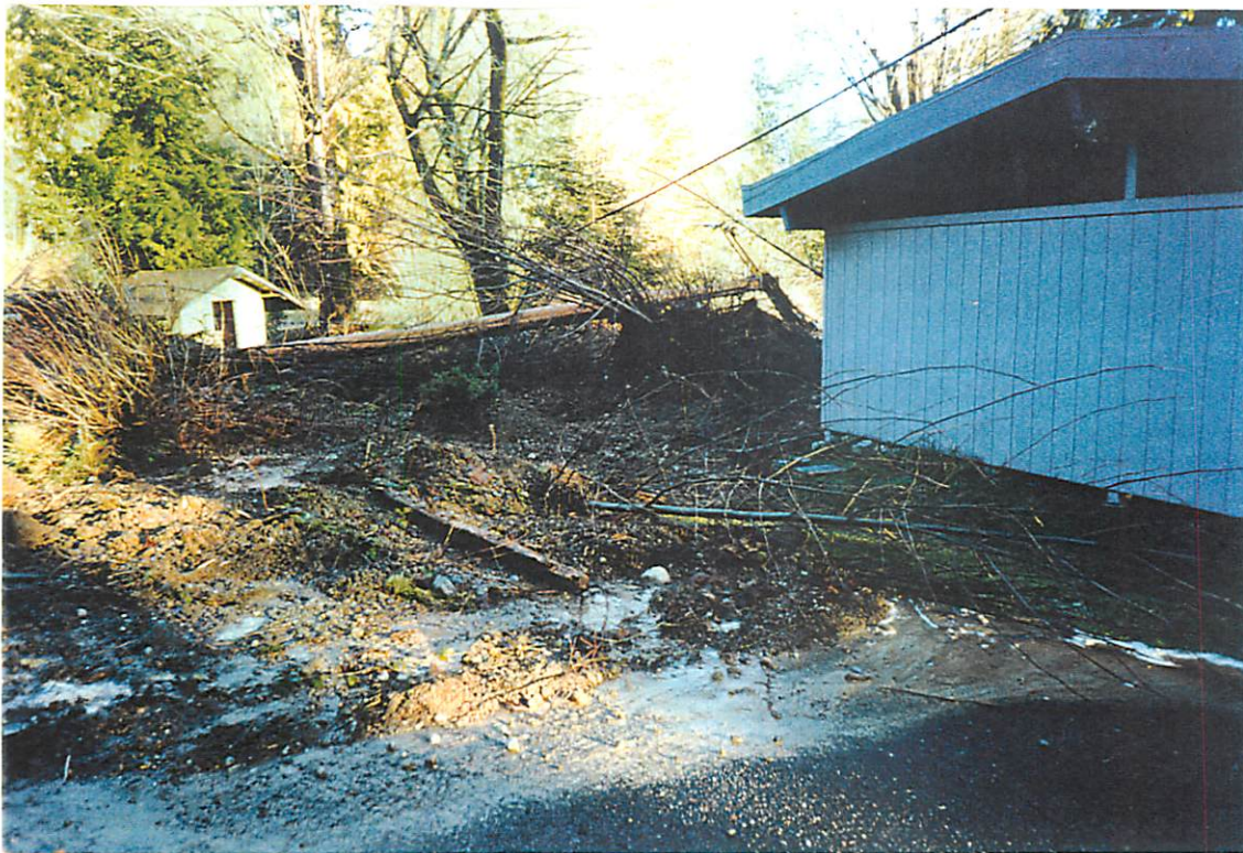
Macy: This landslide was the third to block the road. A portion went through this little creek and out into McAllister Creek.