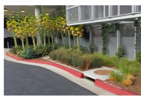
Modular Wetland Installation