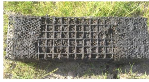
Modular Wetland treatment cartridge in need of maintenance