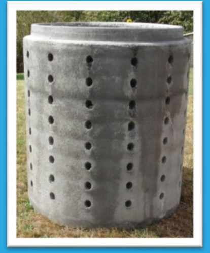
Drywell cylinder, pre-

The typical drywell has a reinforced circular lid at the surface of the road, with a perforated concrete cylinder beneath it. The cylinder is surrounded by gravelly loose soils. Most drywells are designed to infiltrate water over a 72 hour period.