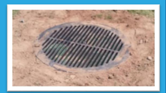
Keep lids clear of sediment & debris

To measure sediment accumulated in the sump of your catch basin or drywell, insert an avalanche pole or PVC tube through the top grate. Sediment depth should not exceed 1/3rd the depth of the sump.