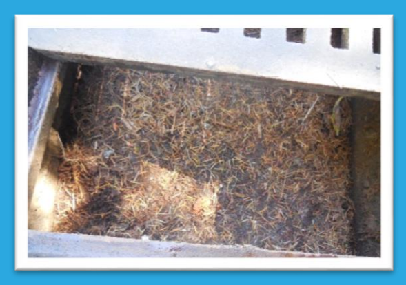
Nearly full of sediment – this catch basin is in serious need of maintenance