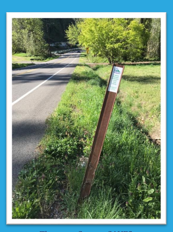
Thurston County CAVFS

Compost can become clogged which will require replacement. Including vegetation with compost helps prevent the medium from becoming plugged with sediment.