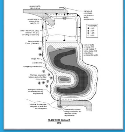
TC Stormwater Wetland option 2 – more naturalistic version

Constructed wetland designs and their maintenance features are similar to wet ponds. With constructed wetlands, there are two cells separated by a berm, where pretreatment is accomplished in the settling cell. Because of this, more regular sediment removal will be required in the settling cell than the wetland cell. Furthermore, unlike wet ponds, plant vigor and biomass are primary design concerns, not water volume (as with wet ponds). Both cells will accumulate organic matter "deltas" in the bottom of the marsh, which should be removed (typically every 8-10 years).