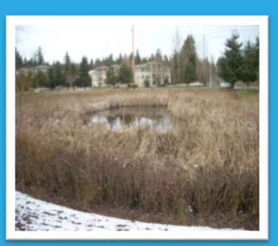
Wm Bush Park Wetland in Lacey