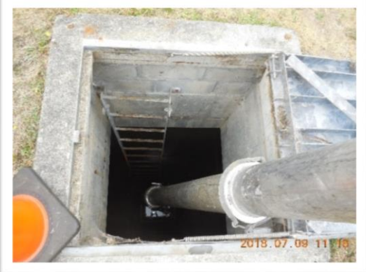
Thurston County storm vault maintenance

Inside the storm vault, conditions of pollutants and standing water can cause noxious gasses to form and accumulate to dangerous levels. No NOT enter until you have first attended the required training and received necessary permit(s). Always ensure that there is a clearly marked and safe entrance into the confined space before attempting entry.