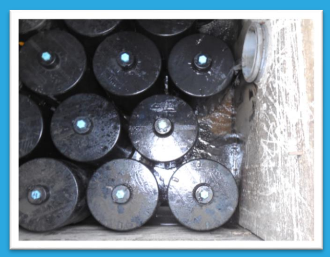
recently maintained stormwater filter vault

Maintenance frequency will always depend on the amount and type of pollutants targeted, location, and the number of large storm events.