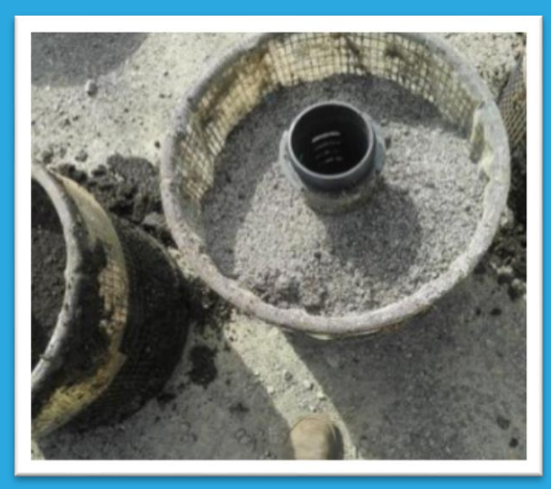
A look inside a Contech filter cartridge

When hiring a contractor to perform treatment device services, we recommend looking for a contractor certified by the manufacturer.