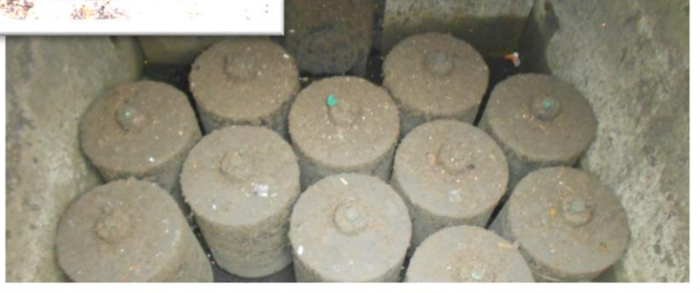
Storm filters in need of maintenance