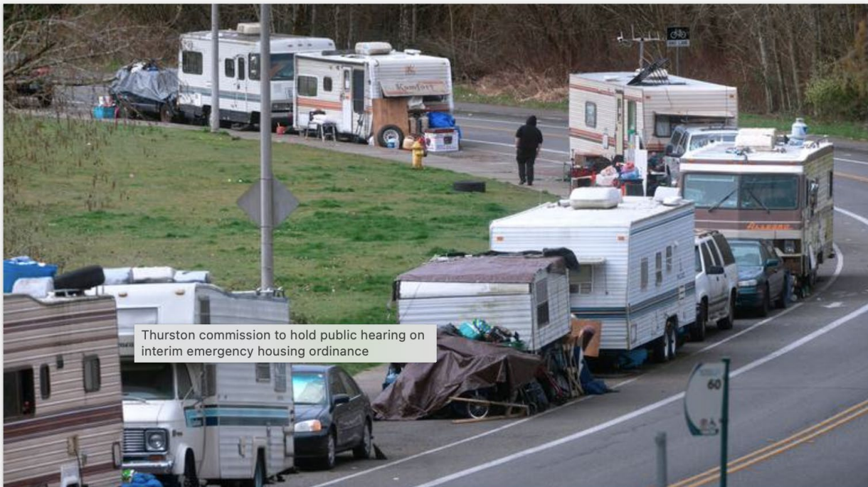
Thurston commission to hold public hearing on interim emergency housing ordinance