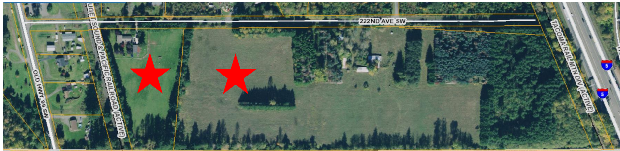
Figure 1. Aerial photo of 5505 & 5641 222 nd Avenue SW

The property addressed as 5505 222 nd Avenue SW has one single family structure that was constructed in 1927 and is currently vacant. Also located on the property are 3± accessory structures. The site was used as a Christmas tree farm, however it stopped serving that purpose within the last ten years. The property addressed as 5641 222 nd Avenue SW has one single family structure that was constructed in 1964 and one accessory structure.