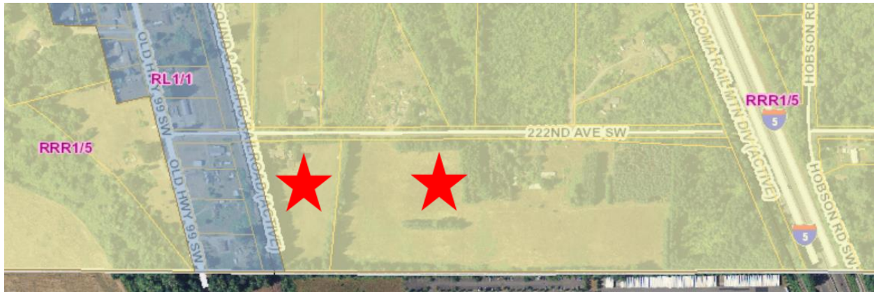
Figure 3. Aerial of the current zoning of the parcel and surrounding areas

Land Use Designation and Zoning: Port Master Plan District PMP (Title 20 Lewis County Zoning Ordinance)