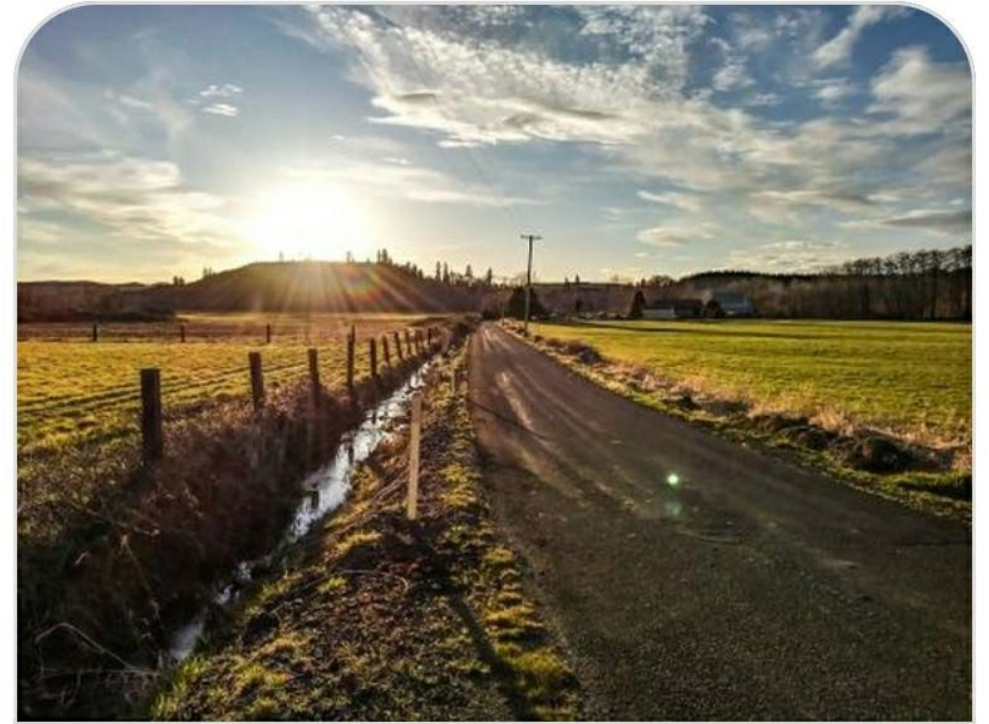
Thurston2040 Photo Contest Winner