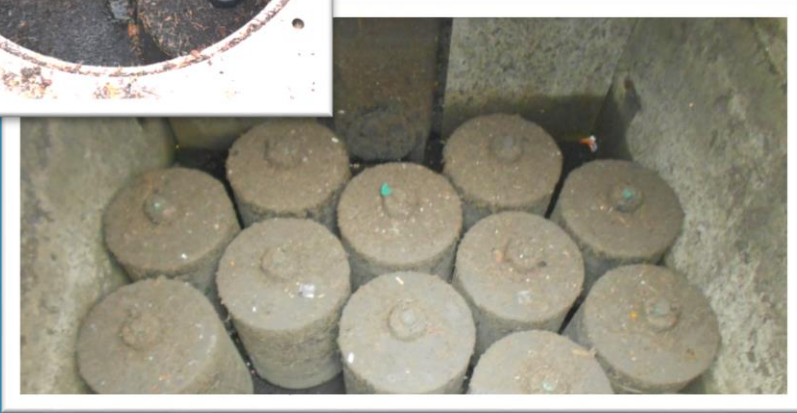
Storm filters in need of maintenance