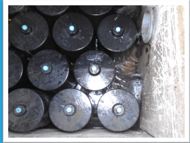
Source: SPEL Environmental - recently maintained stormwater filter vault

Maintenance frequency will always depend on the amount and type of pollutants targeted, location, and the number of large storm events.