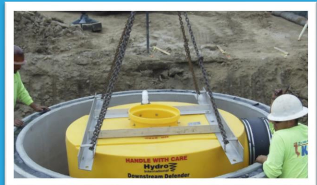
Hydrodynamic Separator

Contractors are encouraged to receive specific training by the manufacturer's of proprietary devices. All Best Management Practices (BMPs) should be maintained in accordance with the manufacturer's recommendations and schedules. Facility owners are required to provide all maintenance logs to Thurston County's Stormwater Utility at the end of each calendar year.