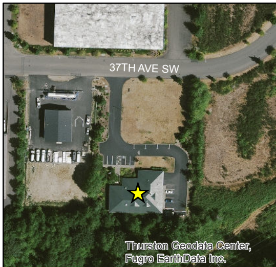
Thurston Geodata Center, Fugro EarthData Inc.