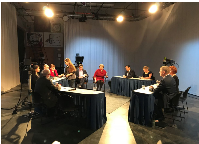
The Department Directors of Thurston County's seven departments discuss services their departments provide, ways they work together, and some of the biggest challenges and opportunities the County has in coming years.

The Appointed Directors of Thurston County's seven departments, along with the County Manager and Assistant County Manager, sat down for the County's first Meet the Directors television special to explore some of the biggest challenges and opportunities facing Thurston County in the coming years. The episode is available on Comcast channel three and the County's YouTube channel at https://bit.ly/2nFCehi .