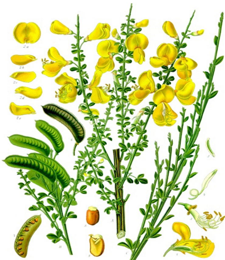
Cytisus scoparius (L.) Link

Mechanical methods can be used on larger infestations with the use of brush cutters, tractor-mounted mowers, or backhoes. Cutting stems in the spring and early summer will result in new shoot production and poor control. However, up to 80% mortality can be achieved by cutting down plants when they are drought stressed (July through September).